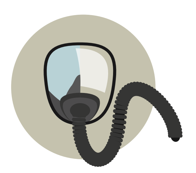
Use breathing apparatus everywhere on the fireground