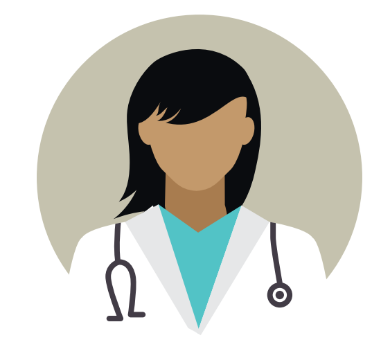
Schedule annual medical exams

Learn more: "Taking Action Against Cancer in the Fire Service," hwll.co/fcsnwhitepaper