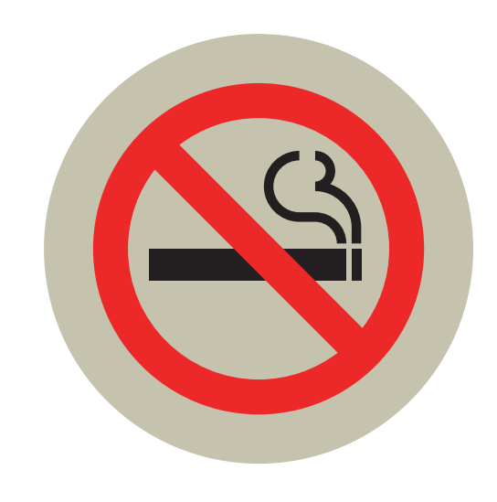
Stop using tobacco