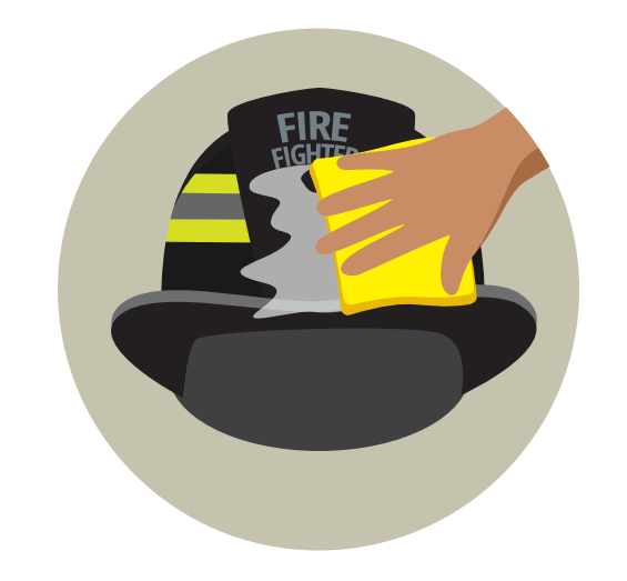
Clean all turnout gear immediately – inside and out