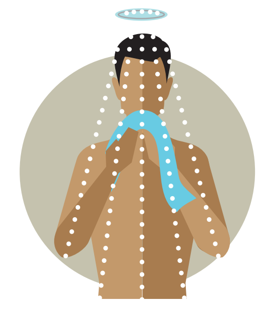
Shower thoroughly after a fire