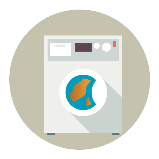
Wash clothes immediately after a fire