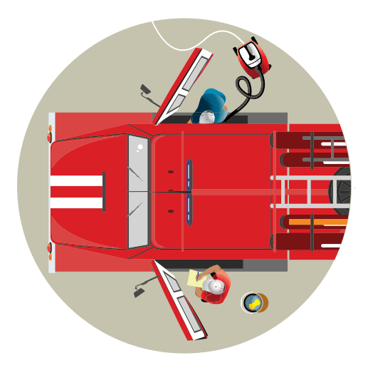
Decontaminate fire apparatus interiors