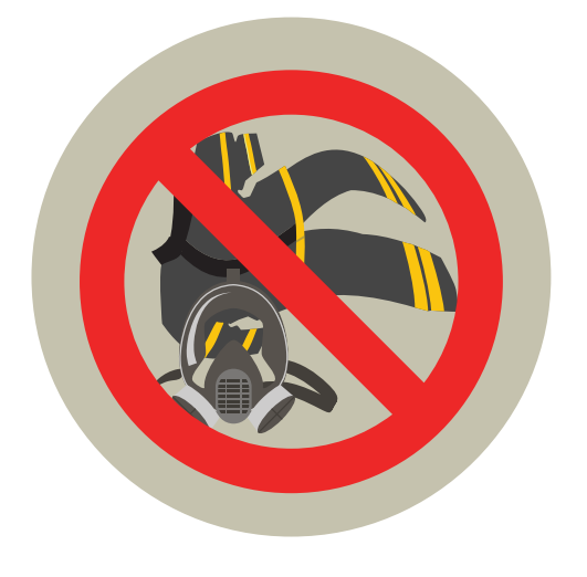
Do not store contaminated clothes/gear at home or in vehicles