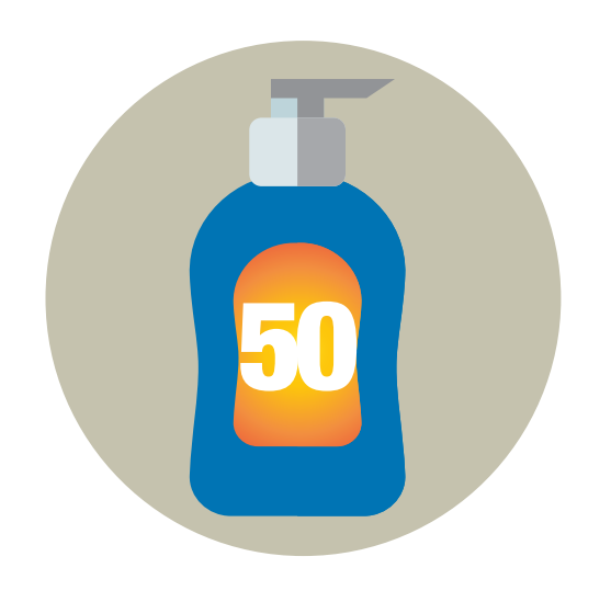
Use sunscreen or sun block