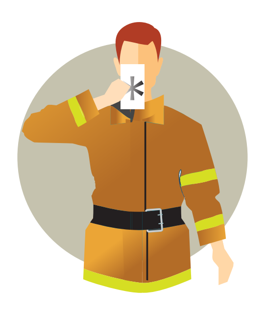
Wet-wipe soot from face, neck, hands on the scene